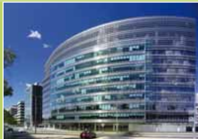
18 Marcus Clarke Street, Canberra, ACT