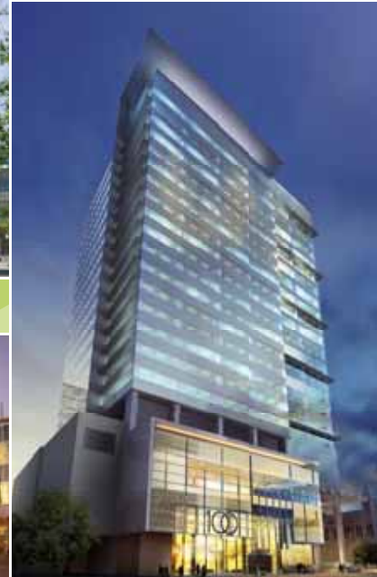
100 St Georges Terrace, Perth, WA (Graphic impression)