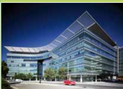
7 London Circuit, Canberra, ACT