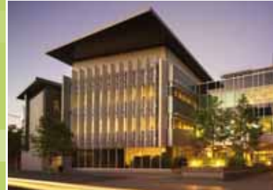
Green Square South Tower, Fortitude Valley, QLD