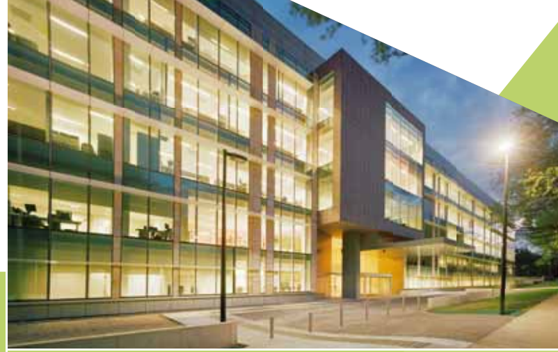
One National Circuit, Canberra, ACT