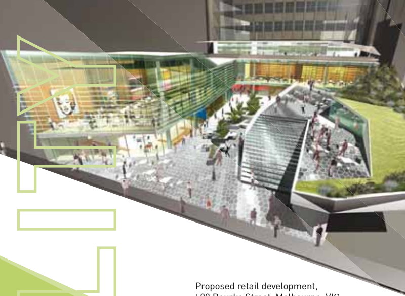
Proposed retail development, 500 Bourke Street, Melbourne, VIC