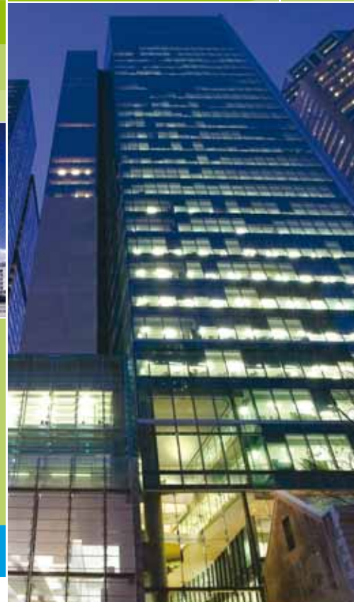
The Urban Workshop, 50 Lonsdale Street, Melbourne, VIC