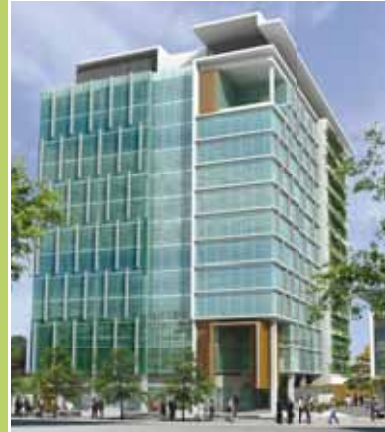
Green Square North Tower, Fortitude Valley, QLD (Graphic impression)